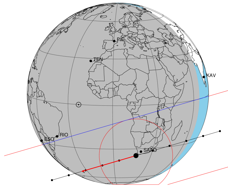
2027-09-23T01:21:45.4400 α: 01 40 13.0228 δ: +07 26 37.642 C/A 0.742" PA 163.73 deg v_sky -20.46 km/s D 08.41 AU

Titan 2027-09-23T01:21:45 K14.72 G17.56 dots 60.0 sec Pt