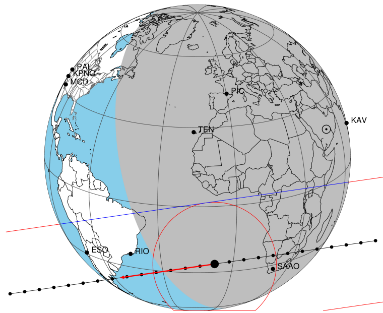
2031-01-21T20:57:01.0200 α: 03 59 45.5027 δ: +18 37 54.885 C/A 0.727" PA 171.72 deg v_sky -10.26 km/s D 08.52 AU

Titan 2031-01-21T20:57:01 K14.56 G16.40 dots 60.0 sec Pt