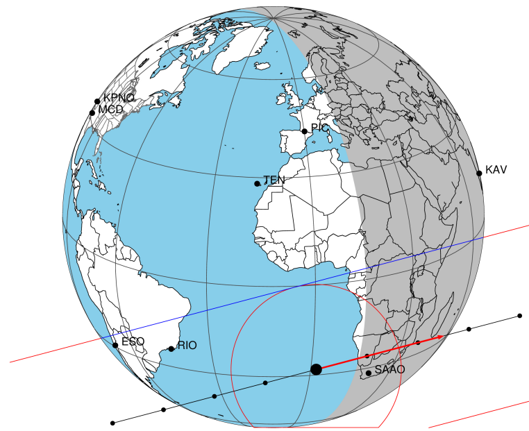
2031-03-18T17:10:14.0500 \alpha : 04 06 46.6620 \delta : +19 09 49.299 C/A 0.701" PA 165.20 deg v_sky +26.53 km/s D 09.42 AU

Titan 2031-03-18T17:10:14 K12.87 G14.81 dots 60.0 sec Pt