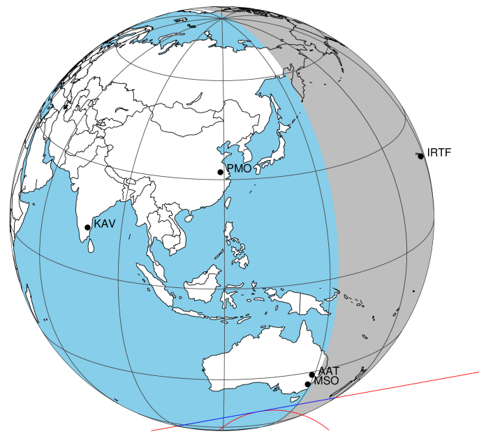
2031-03-27T07:55:48.0900 \alpha : 04 09 26.2895 \delta : +19 21 21.315 C/A 1.226" PA 169.85 deg v_{sky} +21.38 km/s D 09.54 AU

Titan 2031-03-27T07:55:48 K14.69 G18.94 dots 60.0 sec P