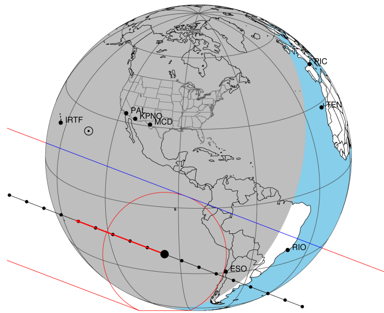
2034-12-09T08:46:34.5400 α: 08 27 27.9872 δ: +19 27 22.817 C/A 0.702" PA 200.85 deg v_sky -12.80 km/s D 08.37 AU

Titan 2034-12-09T08:46:34 K11.41 G12.59 dots 60.0 sec Pt