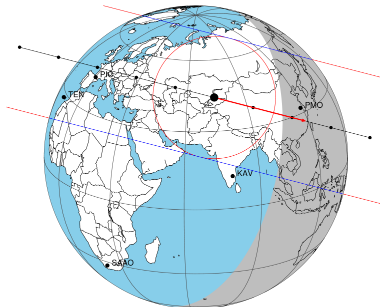
2035-05-25T11:44:04.0700 α: 08 11 31.2705 δ: +20 30 11.088 C/A 0.377" PA 14.50 deg v_sky +28.14 km/s D 09.61 AU