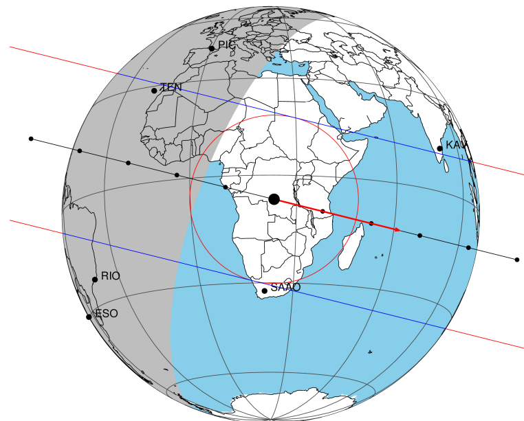
2042-01-04T05:47:33.5900 cc: 14 12 41.2031 d: -10 47 00.639 C/A 0.067" PA 13.98 deg v_sky +25.49 km/s D 10.08 AU