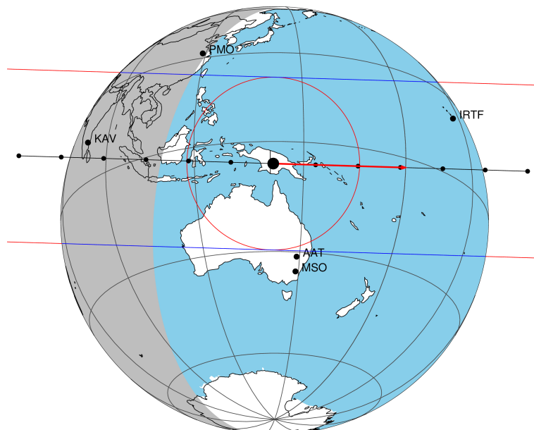
2046-02-04T22:50:24.4800 α: 17 17 28.2250 δ: -21 38 14.024 C/A 0.222" PA 1.73 deg v_sky +21.07 km/s D 10.54 AU

Observable events with sun below -5 deg and altitude above 5 deg