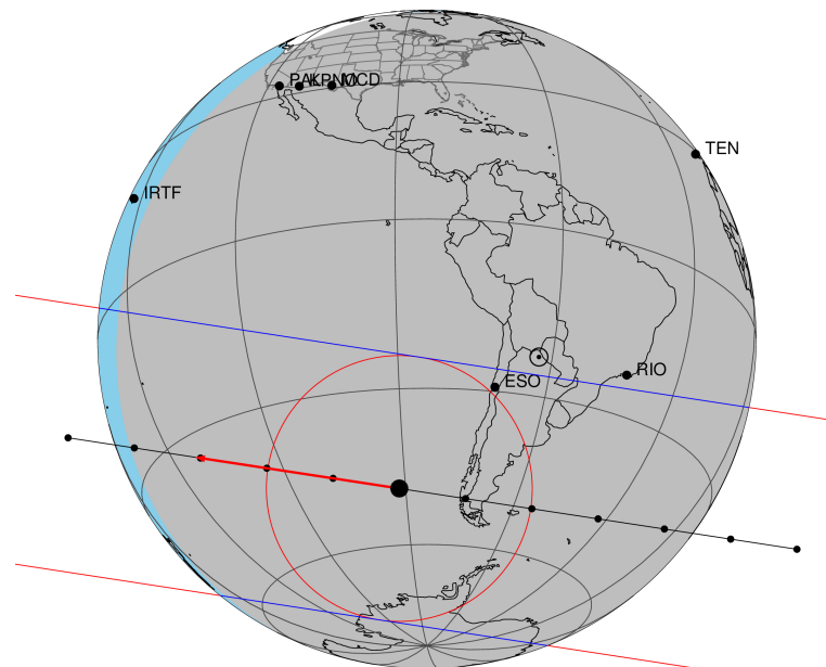
2046-06-30T04:14:28.7300 cc: 17 07 42.3512 d: -21 22 41.823 C/A 0.447" PA 188.69 deg v_sky -21.64 km/s D 09.07 AU