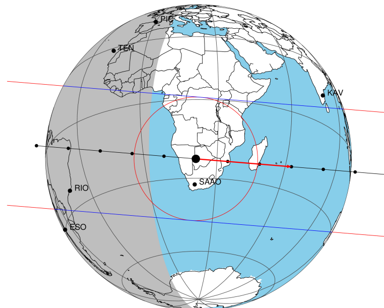
2047-03-05T05:53:05.1700 α: 18 11 52.8783 δ: -22 20 10.393 C/A 0.008" PA 184.11 deg v_sky +22.20 km/s D 10.32 AU

URKALLv1.spk naif0012.tls nep097.bsp nep101.bsp sat4401.bsp Observable events with sun below -5 deg and altitude above 5 deg