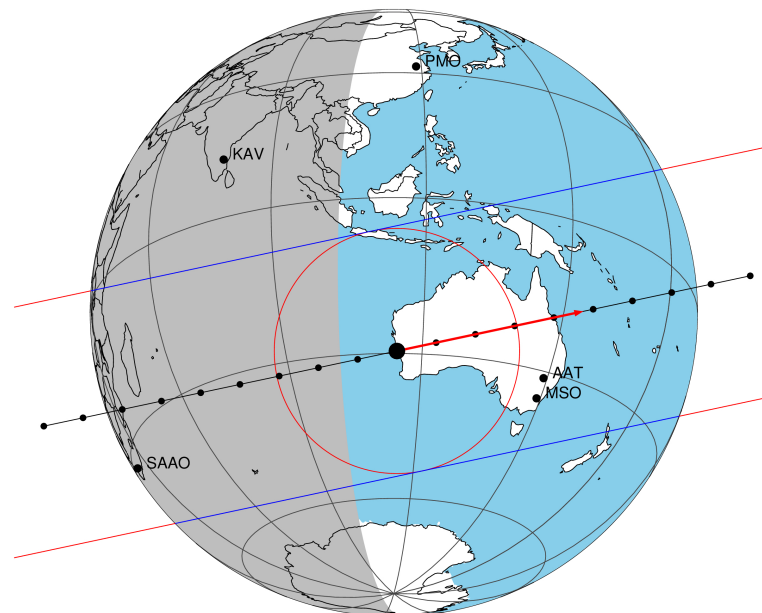
2047-03-13T23:14:52.8000 α: 18 13 36.2949 δ: -22 19 44.245 C/A 0.108" PA 167.97 deg v_sky +14.04 km/s D 10.18 AU

Titan 2047-03-13T23:14:52 K11.31 G16.42 dots 60.0 sec Pgt