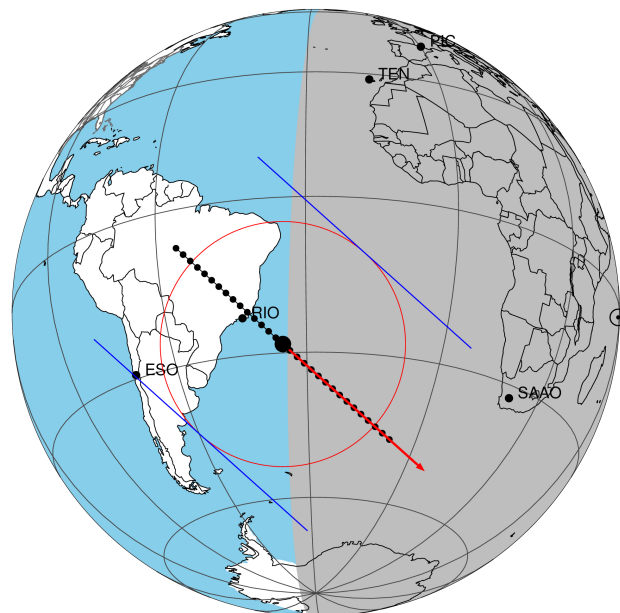
2047-09-15T20:05:16.6600 α: 17 49 12.6971 δ: -22 33 26.550 C/A 0.132" PA 221.90 deg v_sky + 3.34 km/s D 09.90 AU

Titan 2047-09-15T20:05:16 K11.87 G16.70 dots 60.0 sec Pgt