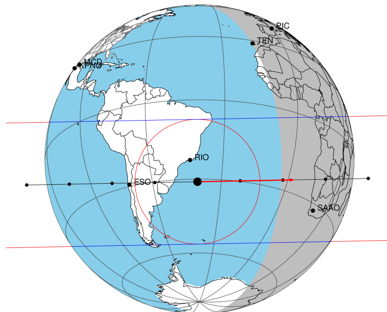
2047-10-25T18:22:14.5600 α: 17 58 04.4436 δ: -22 38 40.152 C/A 0.121" PA 178.91 deg v_sky +29.35 km/s D 10.54 AU

Titan 2047-10-25T18:22:14 K11.99 G15.36 dots 60.0 sec Pgt