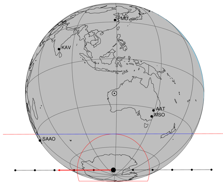
2048-07-03T16:10:56.1100 cc: 18 51 50.25504 s: -22 21 18.061 C/A 0.848" PA 179.84 deg v_sky -23.33 km/s D 09.02 AU